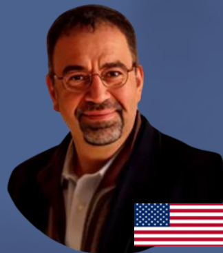
DR DARON ACEMOGLU Winner of the Nobel Prize in Economics 2024